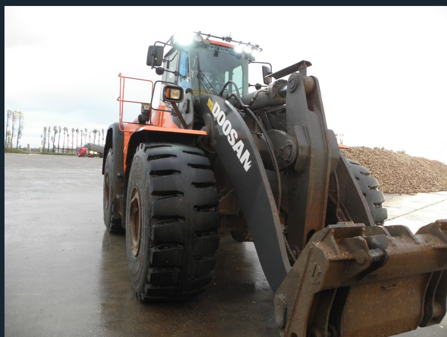
29.5R25 216A2 MS501 MINEXTRA K L5 MAXAM (1122 heures)