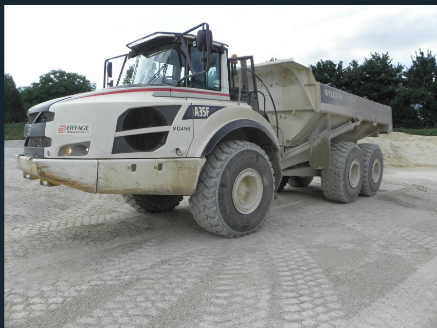
29.5R25 216A2 MS301 K L3 MAXAM (92 heures)