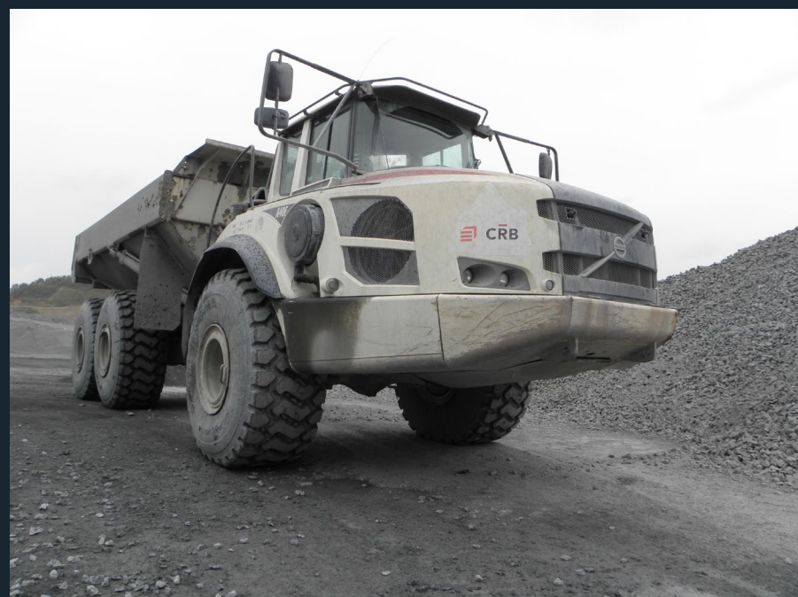
26.5R25 209A2 MS302 K L3 MAXAM (198 heures)