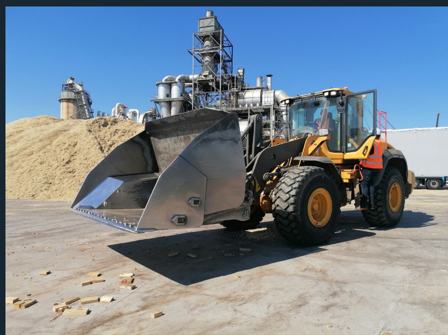
23.5R25 201A2 MS301 K L3 MAXAM (732 heures)