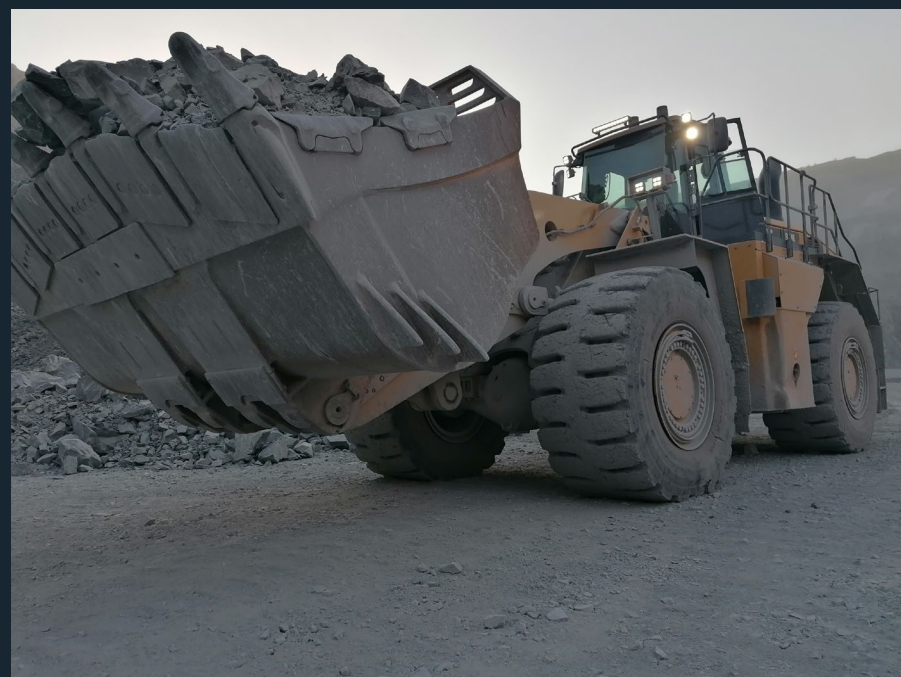
33/65R33 224A2 MS501 MINEXTRA K L5 MAXAM (1800 heures)