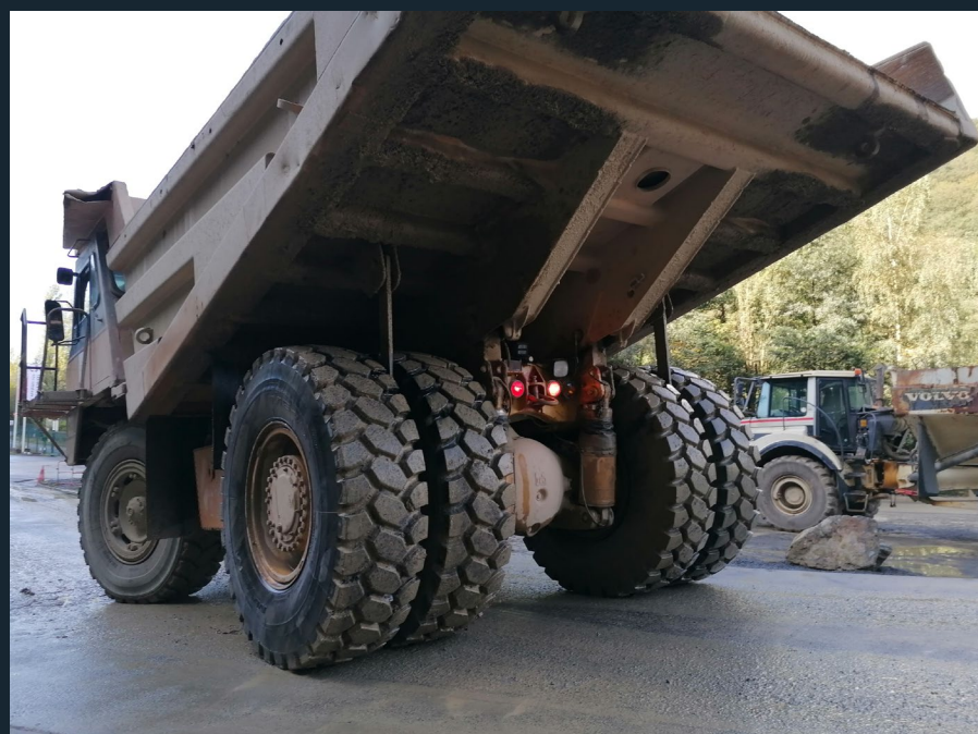
18.00R33 191B MS401 K L4 MAXAM (881 heures)