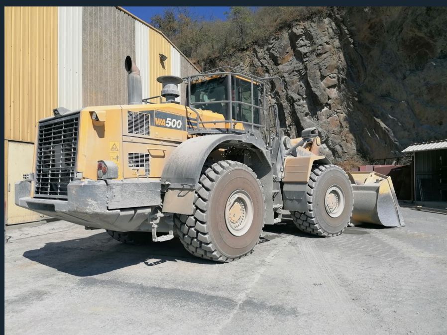
29.5R25 216A2 MS405 K L4 DUMPXTRA MAXAM (173 heures)