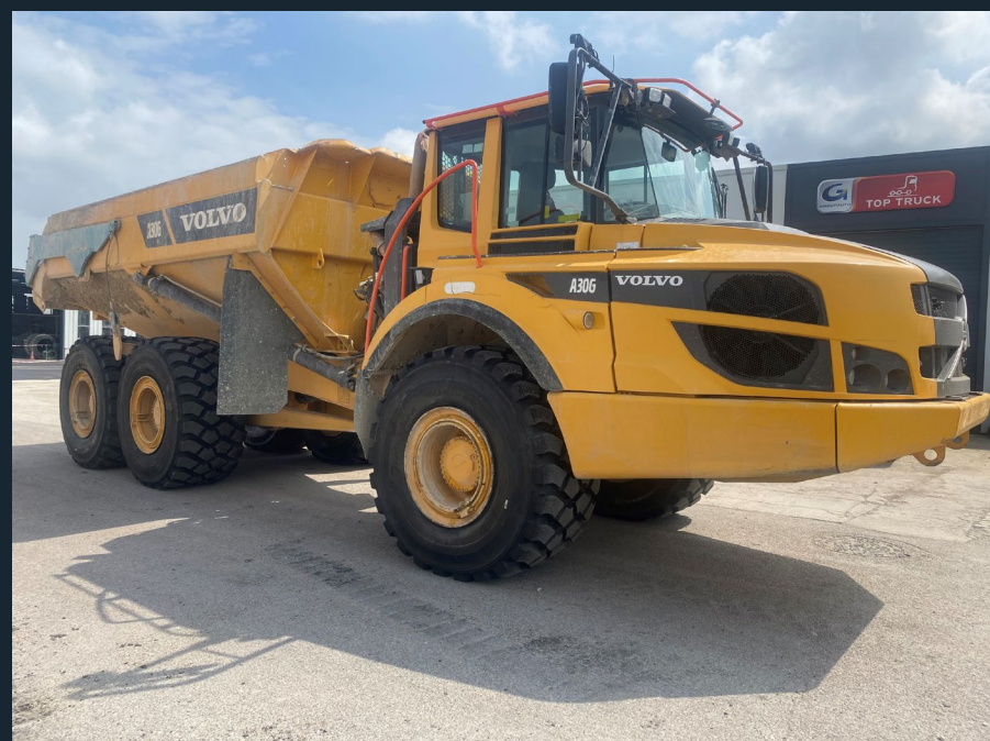
750/65R25 209A2 MS302 K L3 MAXAM