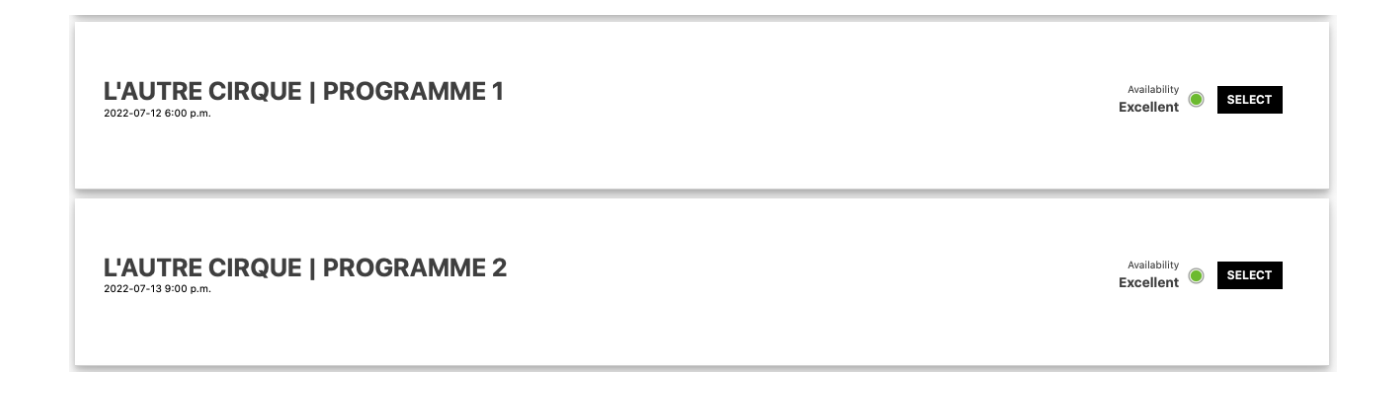
Step 5. Choose a show from the list and click on the SELECT button.

You can now choose the show of your choice to proceed with the exchange.