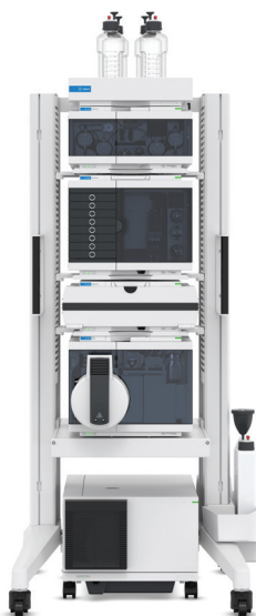
Agilent FlexBench MS (G6015B*) for Agilent Ultivo QQQ LC/MS and InfinityLab LC/MSD