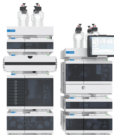
1290 Infinity II LC Workflow