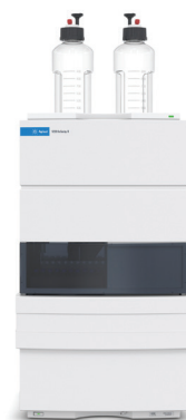
1220 Infinity II LC Workflow