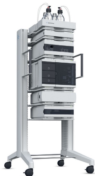
Agilent FlexBench (5043-1759*)