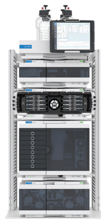
Agilent Benchtop (5043-1740*)

*with power strip, available in regions except Asia Pacific. For Asia Pacific please use part numbers for benches without power strip: 5043-1252, G6015A, 5043-1711 from left to right