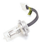
InfinityLab Long-life Deuterium Lamp