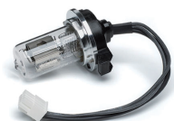
InfinityLab Long-life HiS Deuterium Lamp