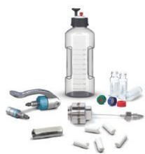
InfinityLab Starter Kit (Partial)