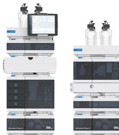
1260 Infinity II Prime LC Workflow