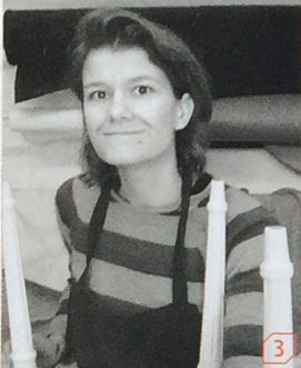
Virginie Lobrot of Virginie Lobrot

product Untitled 51. standout Wooden panels applied with zinc and bronze leaf perpetually evolve, since oxidation constantly transforms the metals. frederique-domergue.com. circle 421