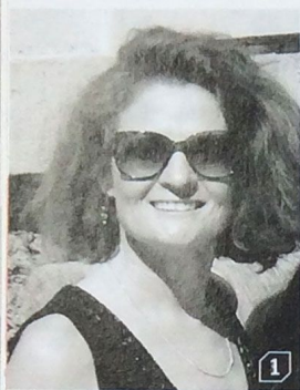
Natalie Sanzache of Natalie Sanzache

product Concrete Dream. standout Cast from a homemade concrete mixture, the swirling texture and colors of the pendant fixture's interior draws inspiration from Marc Chagall artwork. nataliesanzache.fr. circle 420