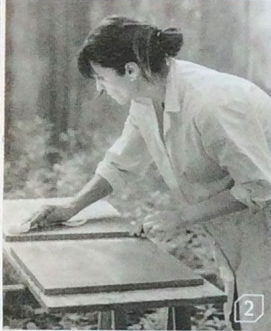
Frédérique Domergue of Frédérique Domergue

product Concrete Dream. standout Cast from a homemade concrete mixture, the swirling texture and colors of the pendant fixture's interior draws inspiration from Marc Chagall artwork. nataliesanzache.fr. circle 420